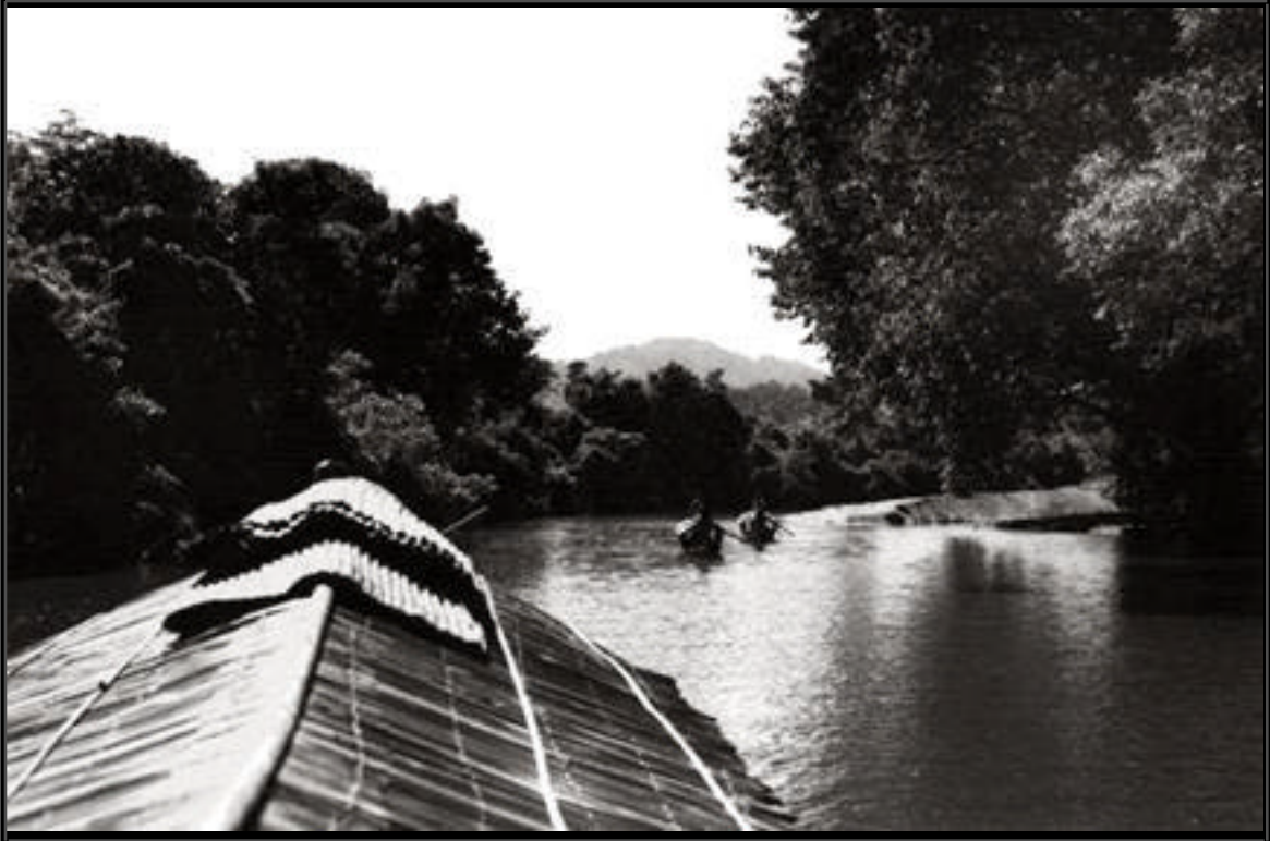
Sungai Tersat - Kajangan