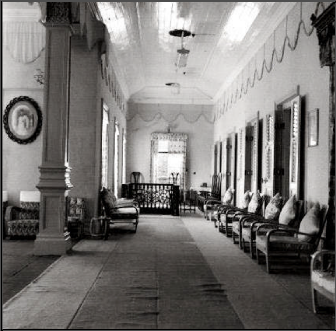
Istana Maziah (The Palace) - Interior Scene (ca. 1949)