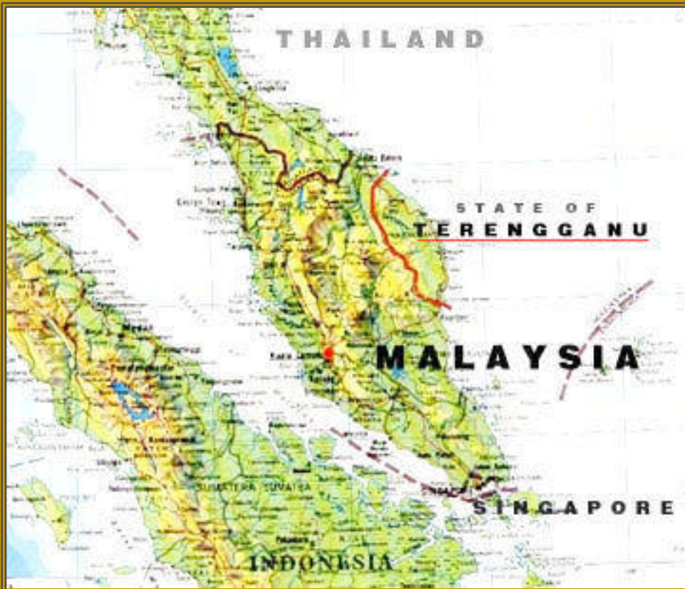
MAP OF WEST MALAYSIA