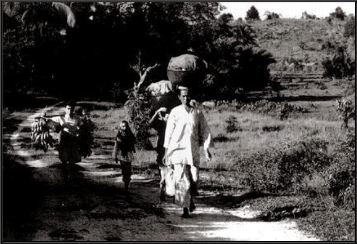
Wakaf Tokeh, Terengganu.(ca. 1955)