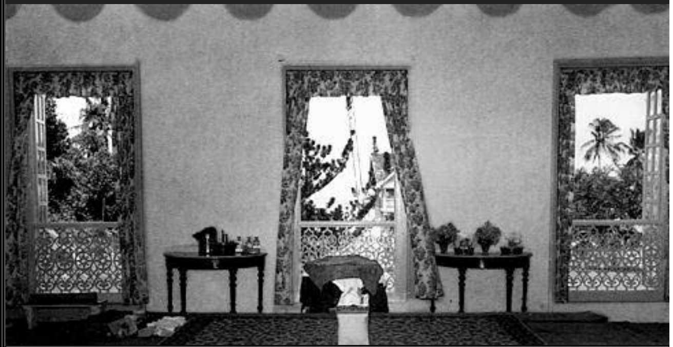
Jendela (ca. 1950)

Taken prior to a royal ritual ceremony inside the Istana Maziah.