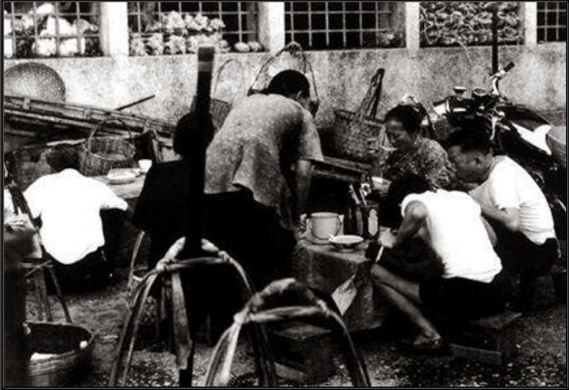
Tengahari P e n a n g, (ca. 1959)